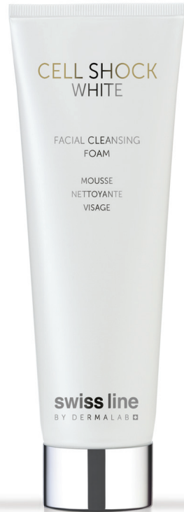
FACIAL CLEANSING FOAM