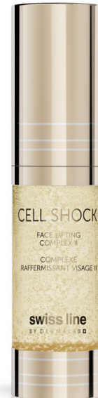
FACE LIFTING COMPLEX

Brand classics that have stood the test of time. Immediately tensing, they result in a noticeable "face lift" within minutes, for more toned and contoured features.