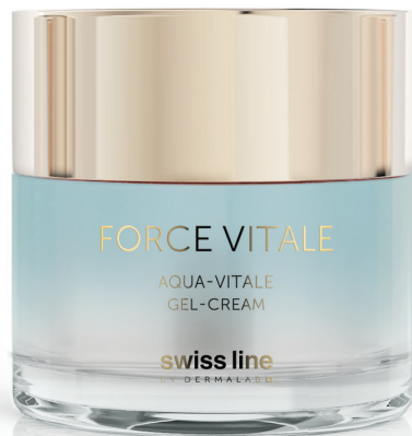
GEL-CREAM UNIVERSAL – FRESH

Fast-penetrating moisturizer that instantly melts to infuse skin with hyaluronic acid and an oat extract rich in beta glucans strengthen skin's own hydration and have great antioxidant power. Natural lecithin obtained from soy instantly shields, creating a smoother surface, without the oily touch.