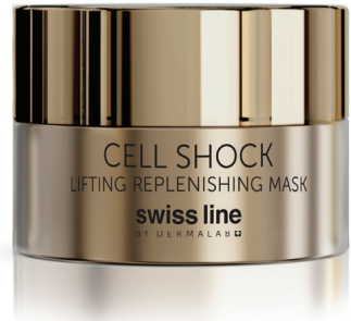
LIFTING REPLENISHING MASK

Super-achieving specialists for specific needs: overall tired skin, and particular needs of neck and décolleté. Proteins from soy, activated oligo-elements and anti-glycation peptides; all united contribute to elevating your skincare to the extraordinary.