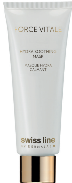
HYDRA SOOTHING MASK

Milky-cream mask to reduce the appearance of fine lines as it deeply hydrates and soothes the skin. Alpine botanicals, extracts of iris root and refreshing cucumber within minutes reduce the signs of dryness, tightness, and give skin a healthy glow.