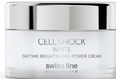
DAYTIME BRIGHTENING-POWER CREAM

While the daytime cream is enriched with antioxidants and licorice root extract, for all-day reduction of inflammation reactions that can aggravate hyper-pigmentation; the overnight formula gently re-texturizers with enzymatic factors, so to facilitate reduction of already-there signs of unevenness.