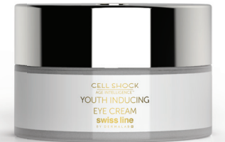
YOUTH-INDUCING EYE CREAM with Madecassoside®, plant-based mimetic growth-factors and flavonoids