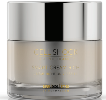
SMART CREAM RICH with Madecassoside®, NMF, ATP, Ectoin®, Ceramides and Squalane