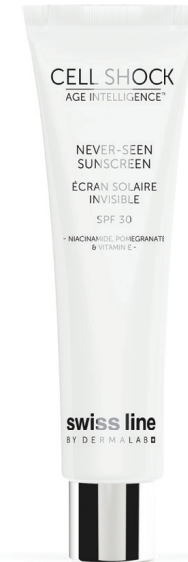
NEVER-SEEN SUNSCREEN SPF 30 with Niacinamide, Pomegranate and Vitamin E

Non-oily gel-cream for an absolutely invisible and matte finish! A sunscreen product that doubles as a skin caring step to offer multi-benefits: it brightening and promotes barrier function, includes potent anti-oxidants and moisture-binding factors to prevent any discomfort.