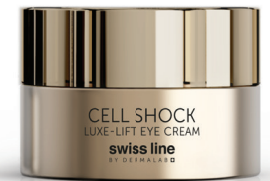
LUXE-LIFT EYE CREAM