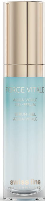
GEL-SERUM MOIST – FRESH

Oil-free serum leaves skin feeling clean and looking plumped. With alpine flowers including echinacea, hyaluronic acid, beech tree shoots and red algae extracts.