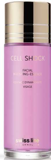
FACIAL BOOSTING ESSENCE