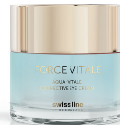
CORRECTIVE EYE CREAM

A brand best-seller formulated to reduce lines and wrinkles, as it also contributes to de-puff and refreshes the look of tired eyes. With Matrixyl™ 3000, hyaluronic acid, alpine flowers and caffeine; it also contains olive and wheat germ oils to support barrier function.