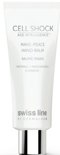
MAKE-PEACE HAND BALM with Panthenol, Madecassoside® and Echinacea

The most caressing hand care product ever! Dressed in a gel-balm texture, it works like a second-skin. Physically protecting and repairing aggressed hands throughout the day... and at all times. This glove-like formula should additionally be "worn" overnight as a recovery leave-on hand mask.