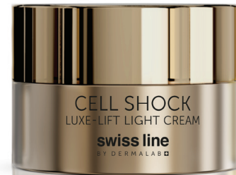
LUXE-LIFT LIGHT CREAM

Four inspired formulas combining marine collagen, plant-based mimetic growth-factors and proteins from silk. They boost the synthesis of collagen and the extracellular matrix, so as to improve density and firmness.