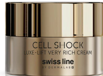
LUXE-LIFT VERY RICH CREAM