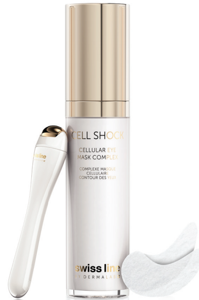
CELLULAR EYE MASK COMPLEX