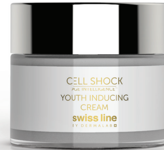
YOUTH-INDUCING CREAM with Madecassoside®, crossed peptides and plant cell cultures