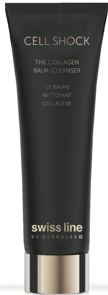
COLLAGEN BALM CLEANSER

Super-achieving and pampering textures resulting from biotechnology: fermented superfoods, proteins from soy, activated oligo-elements and anti-glycation peptides; all united contribute to elevating your skincare whenever seeking the extraordinary. Here also the first step in your Cell Shock ritual – collagen-infused massage cleanse!