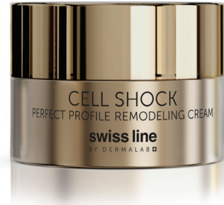
PERFECT PROFILE REMODELING CREAM NECK AND DÉCOLLETÉ