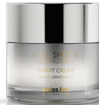
SMART CREAM with Madecassoside®, NMF, ATP and Ectoin®

The cocooning alternative for those who need a richer texture, for face dehydration and a disrupted barrier-function.