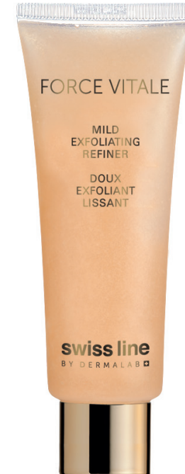
MILD EXFOLIATING REFINER

Invigorating exfoliating gel formulated with gentle non-plastic quartz powder, alpine flowers and vitamins encapsulated in white spheres released upon massage.