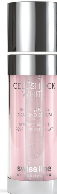
BRIGHTENING DIAMOND SERUM

Expect the best. Believe in the present.