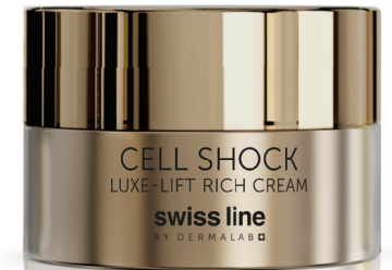
LUXE-LIFT RICH CREAM