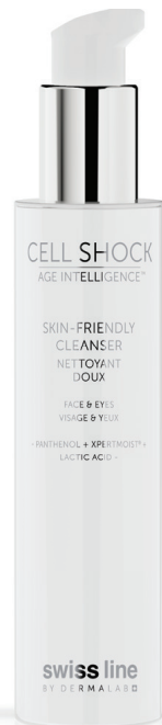
SKIN-FRIENDLY CLEANSER PANTHENOL + LACTIC ACID

A non-foaming facial cleansing gel that isn't soap-based! Gentle enough for removing eye-makeup (non waterproof). To be applied with fingertips directly over a dry face and rinsed-off with running water or with the help of wet cloth/cotton disks as preferred.