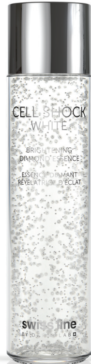
BRIGHTENING DIAMOND ESSENCE