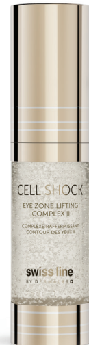
EYE ZONE LIFTING COMPLEX