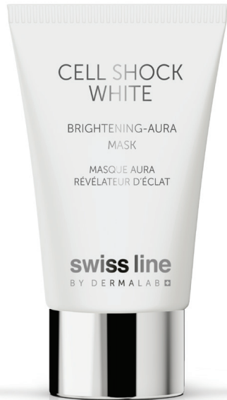
BRIGHTENING AURA MASK

A cocktail of blueberries, maple syrup and glycolic acid, together with clinically proven hexylresorcinol and diglucosyl gallic acid act on various biological pathways to obtain better uniformity, reduction of dark spots, signs of redness and blotchiness.