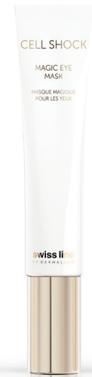
MAGIC EYE MASK

Targeted to the very specific needs of particularly fragile areas, they will infuse skin with engineered forms of hyaluronic acid, ATP, soothing botanicals from land and sea, vitamins and enzymes... depending on how often you apply them, they will become cure-programs, or regular beauty accomplices.