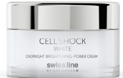
OVERNIGHT BRIGHTENING-POWER CREAM