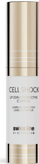
LIP ZONE CORRECTIVE COMPLEX

A particularly fragile area, often neglected – the lip contour. With engineered forms of hyaluronic acid, it can be seen as a cure-program, or a regular beauty accomplice.