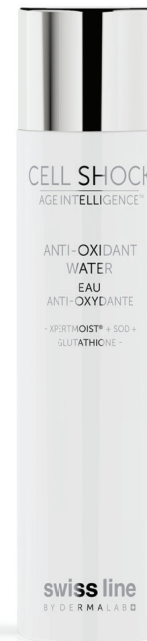
ANTI-OXIDANT WATER ASIATICOSIDE + GLUTATHIONE + SUPEROXIDE DISMUTASE

Alcohol-free skin-respectful toner. Formulated using two skin-identical key antioxidants and barrier promoting ingredients, adapted to all skin conditions including sensitive ones.